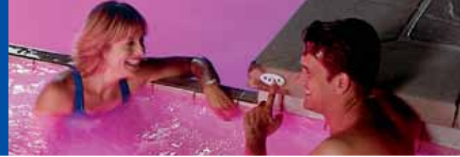
Four-function spa-side remote controls additional items, such as jets, air blower and heater—without leaving the water.