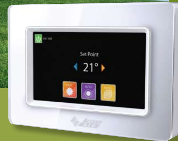
Pictured Right: Your house can be air conditioned throughout with our easy to use E3 control units. With Accent Air systems, you are in complete control.